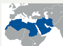
North Africa / MENA